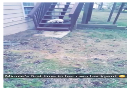
Minnie's first time in her own backyard 🐾

“ 5 files added to the album minnie in action